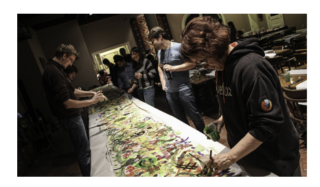
Fig. 30. The PLoP Art School in the Dining Room