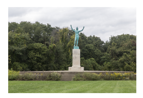
Fig. 28. Sun Singer!