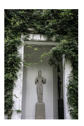
Fig. 18. House of the Golden Buddhas