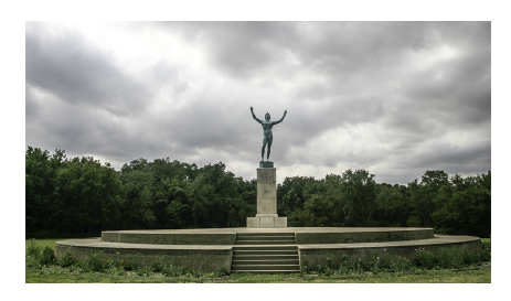
Fig. 27. Sun Singer