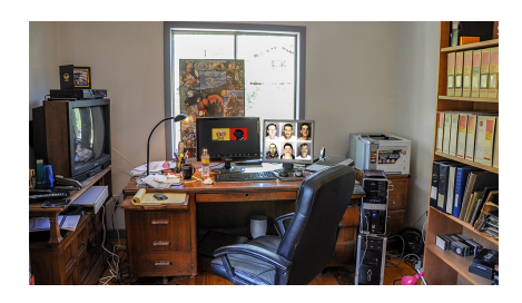
Fig. 31. The Conference in Your Basement

Time for a session, so you grab a bagel, let the dog out, and go downstairs. You get on the site but forget to log on to it, so you can't find the Zoom links. On the Slack help channel you find what you need. Behind you in the laundry room your wife starts a load. You get in the room and see 49 in 7x7 gallery view—some with beaches behind, others with mountains, a TARDIS, the Enterprise bridge, but most with bookshelves, walls, and flags. Many with headphones or headsets, all on forced mute. The session chair introduces the first speaker. Behind you your wife yells for you to bring the towels down.