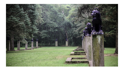
Fig. 16. Fu Dog Garden