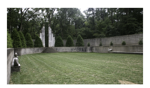
Fig. 25. Sunken Garden

After a good long stretch it gets frankly weird—the Death of the Last Centaur . This statue is far from everything, in a small clearing in a black walnut woodland. The statue is not beautiful. It's disturbing. The walnut trees have a peculiar scent. Some more wandering and you find the grand statue, the Sun Singer .