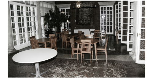
Fig. 9. Papa Del's Pizza