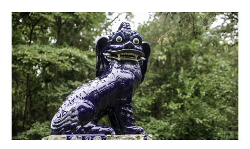
Fig. 17. Fu Dog