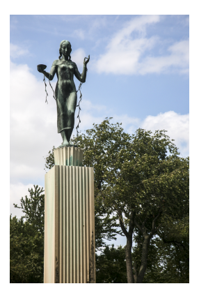
Fig. 38. Bronze Woman

The grounds of Allerton Park contain a number of gardens: Fu Dog Garden, Herb Garden, Brick Walled Garden, Triangle Parterre Garden, Peony Garden, Chinese Maze Garden, Annual Garden, and Sunken Garden.