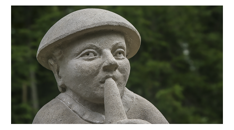
Fig. 23. Flute Player