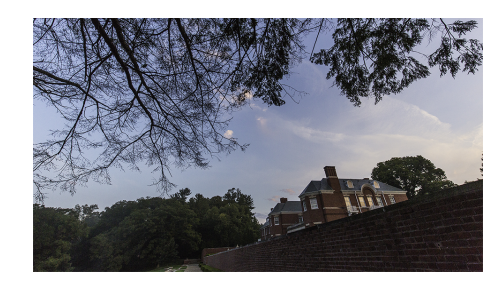
Fig. 15. Up Early