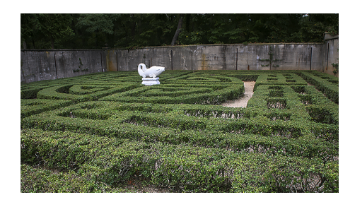
Fig. 21. Chinese Maze Garden