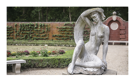
Fig. 20. Girl with a Scarf