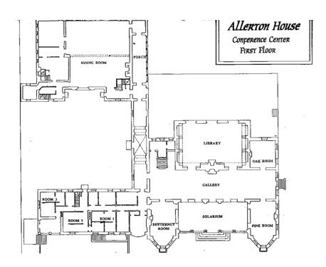
Fig. 37. Allerton Mansion First Floor

Next the strangeness: Allerton Park has a maze, a sunken garden, fake ancient Greek ruins, a fake Roman arena, and nude / bizarre statues—many on forested trails along the Sangamon River. Statues range from the quaint (Fu dogs, Chinese musicians, Bronze Woman) to the strange ( Death of the Last Centaur , the Sun Singer ) to the weird ( Gorilla Carrying Off a Woman, Bear and Man of the Stone Age —a bear death-hugging a hunter who had stabbed the bear in the neck, the hunter still holding a rope attached to a bear cub).<sup>1</sup>