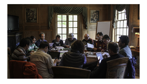
Fig. 13. Oak Room

Your group is assigned to the Butternut Room, a realm of books, warm wood, soft lights, a view to woodlands and the big field. You head for the leather couch beneath the windows; it's soft from years of use. Sitting next to you is the German you don't yet know at all, and, on the other side, a Swede from the parachute game. The last ones in have to drag a few chairs from the adjoining room. The facilitator goes over the writers' workshop method: a writers' workshop . Hmm. The author, whose paper is under discussion, must say nothing at all, remaining, like a fly on the wall, silent to listen attentively to the comments of those who have read and reflected on his draft. Now you see why reading and marking drafts beforehand is important.