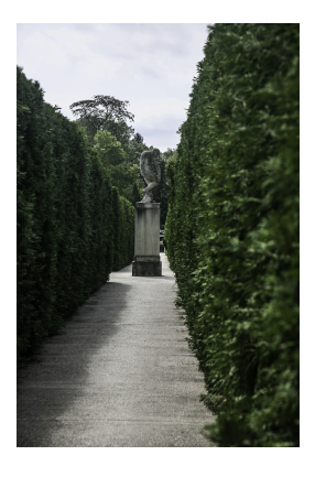
Fig. 19. Adam

Turning southwest you pass a gate house, the Girl With a Scarf sculpture, a sculpture of Adam, the Chinese Maze Garden , and the Avenue of the Chinese Musicians .