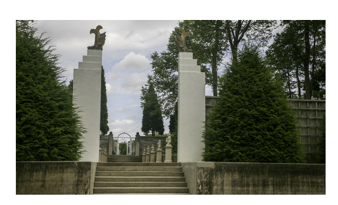
Fig. 24. View from Sunken Garden