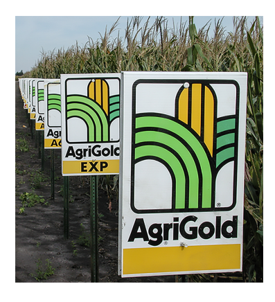
Fig. 36. AgriGold

Hоме, you revise your paper. It's published. You get another new idea.