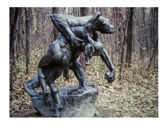
Fig. 40. Gorilla Carrying Off a Woman

One comes away remembering certain small things, haunted by oddities. -Joan Didion, "New Museum in Mexico" Vogue 1965