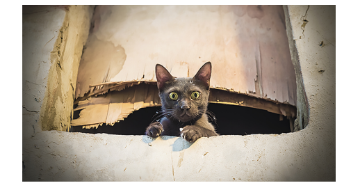
Fig. 32. Your Friend in Holland, Walking Away