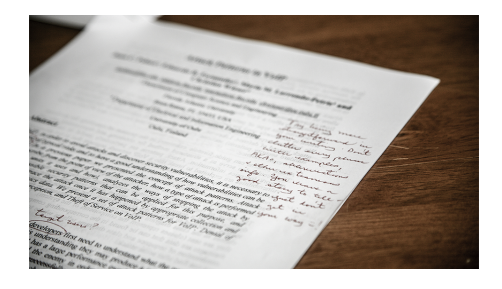
Fig. 14. Work of the Workshop