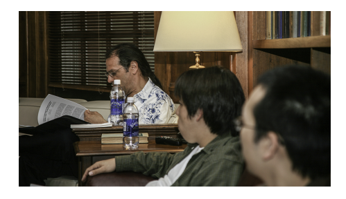
Fig. 34. Writers' Workshop

Your paper is workshopped. For the first few minutes your face turns the color of a copper beech, but then you start to really listen. People see things you knew you put in your paper, but they see other things too. A turn of argument you believed to be obvious threw several totally off track. As promised, the moderator pauses to teach about pattern construction or linking patterns, or he probes one reader's half-thought, or he solicits the group for a bridge between thoughts. Slowly it dawns on you that your efforts at science reside a little less on a page of text and a little more in the groping forward of the conversation itself: the reader/listener is as much a partner in the story creation as you, the writer/speaker. Science is not and cannot be a final draft. As you listen, new thoughts begin to crop up, you see how to connect your work with other research which could make for a larger more robust topos, and you can see how to eliminate some of your awkward phrasing. This is a gift that the group has given you.